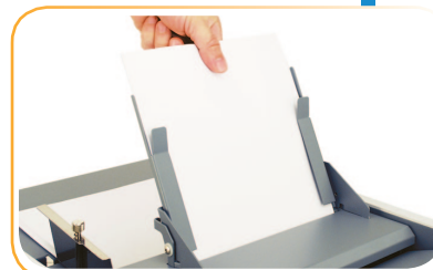
Optional Multi-Sheet Feeder