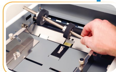
Removable Feed Wheels